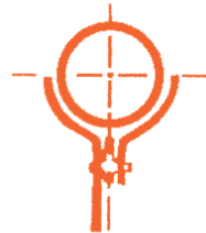
Société Française de Gynécologie de l'Enfance et de l'Adolescence